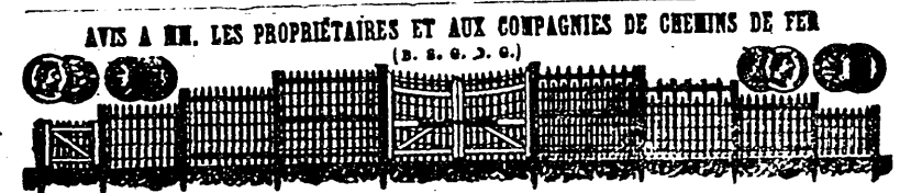
VARA, 1 METRE HIGH, #124 m. Do. 2 METRES HIGH #2